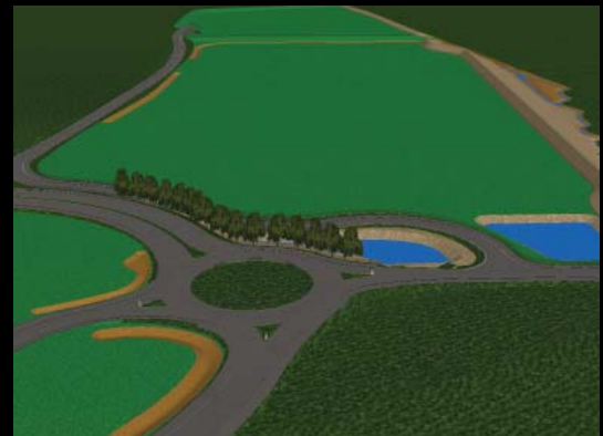
Perspective view of development areas & access roads

“ Using Cubic meant we were able to provide our client with an enhanced understanding of the project. ”